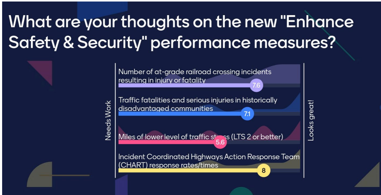
Figure 1. ARAC ranking of new proposed performance measures for the goal "Enhance safety and Security"

* "Miles of lower level of traffic stress (LTS 2 or better) has been moved to the "Serve Communities and Support Economies" goal.