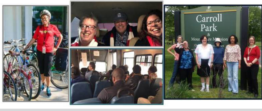
Pictured Above: MDE employees cycling and carpooling, commuters using the shared Montgomery Park Shuttle, and the ATG walking group