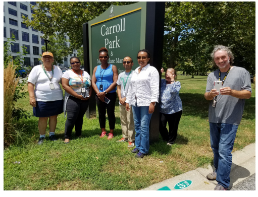
Pictured above: The ATG leads lunchtime walking groups year-round to help MDE employees connect with the surrounding community.

Friends of Carroll Park on a variety of shared community and transportation interests. Like many employers, maintaining connections with MDE colleagues and reaching new employees has been a challenge throughout COVID, but as in-person orientation sessions resume, the ATG expects to have more opportunities to meet new employees and share commuting resources. This fall, the ATG is also planning an event to re-engage with the entire organization and raise awareness of the shuttle, transit, and additional commuting resources available to them.