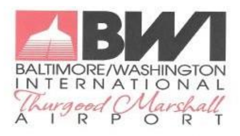
FIGURE 8: TENANT DIRECTIVE