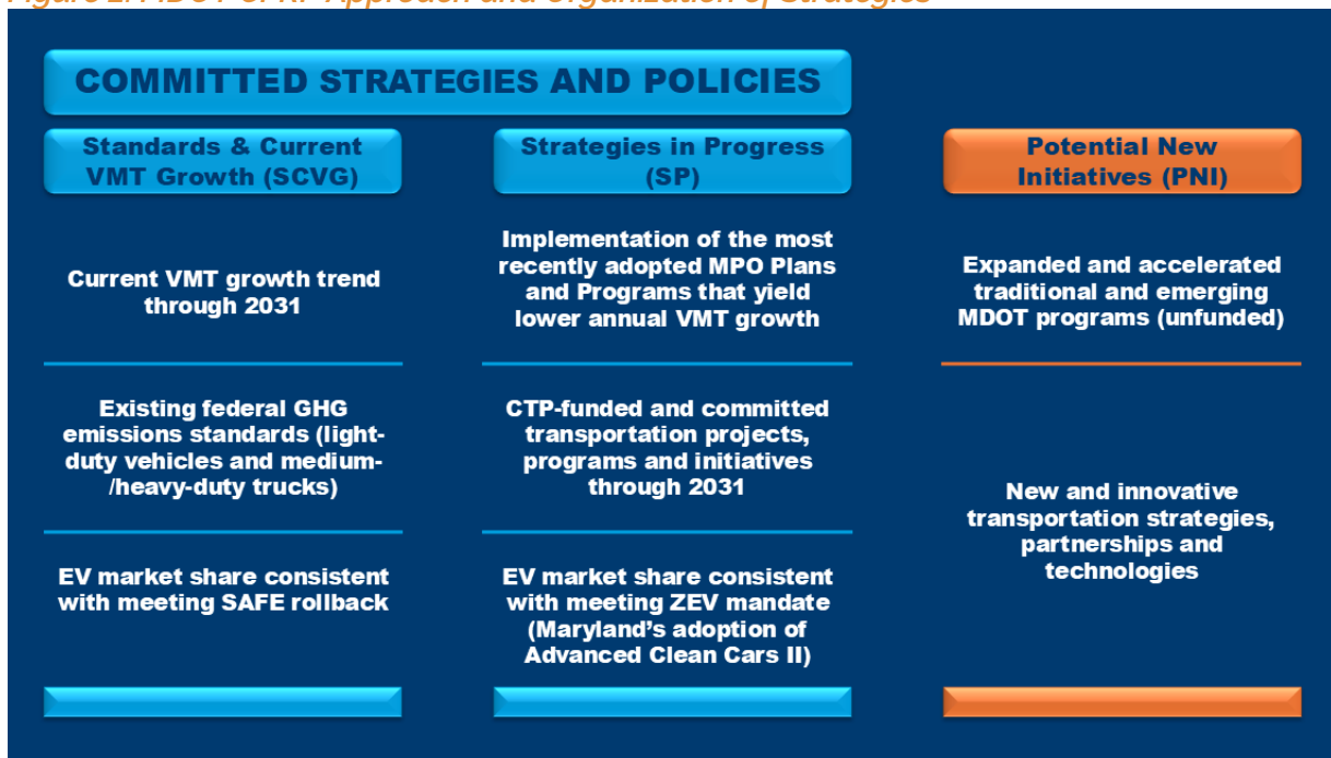
Figure 2: MDOT CPRP Approach and Organization of Strategies

Potential New Initiatives (PNI) consist of currently unfunded emerging and innovative strategies, some of which include uncertainties in the timeliness of adoption, technological maturity, readiness for implementation, and variability in potential level of deployment above and beyond the SP strategies. See Figure 3 on the next page.