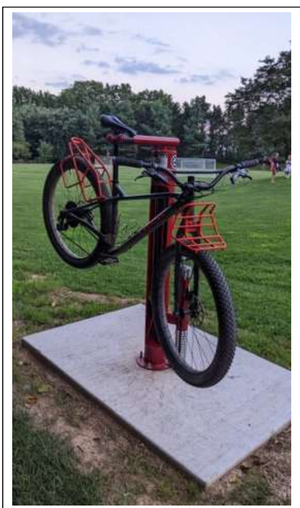
The Ma & Pa Heritage Trail Foundation utilized Bikeways funding to install a bike fixit stand at Friends Community Park in Hickory .