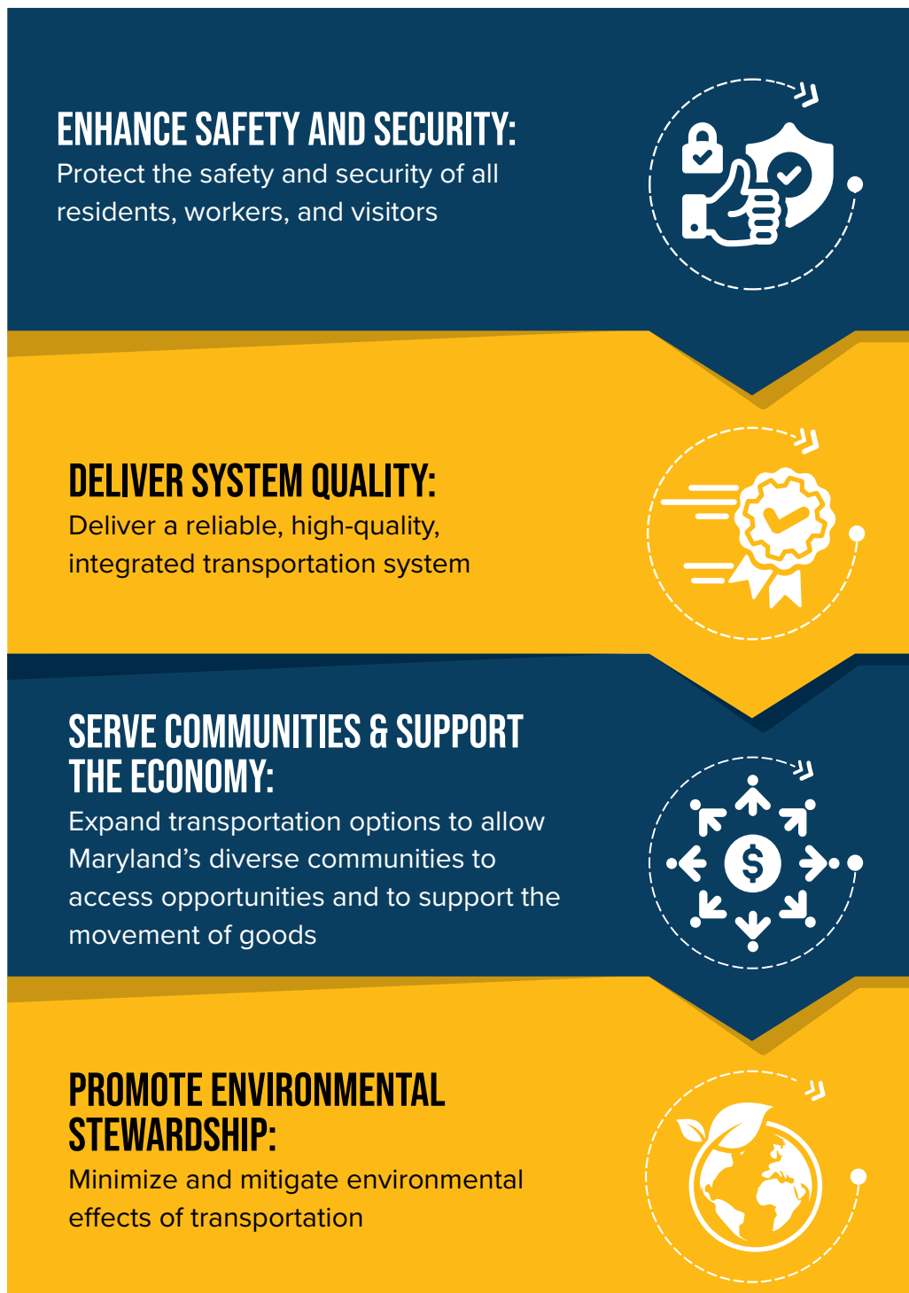
Figure 2: Graphic showing the 2050 MTP Action Plan Goals with Icons