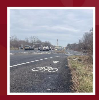
2024 RAISE Grant Application: Project Description