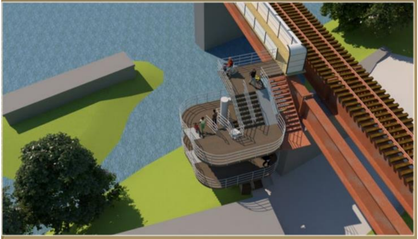
Figure 1 The National Park Service received a Bikeways award to design a bicycle-accessible ramp from the C&O Canal towpath to the Byron Bridge over the Potomac River. The project will move forward with final design and construction.