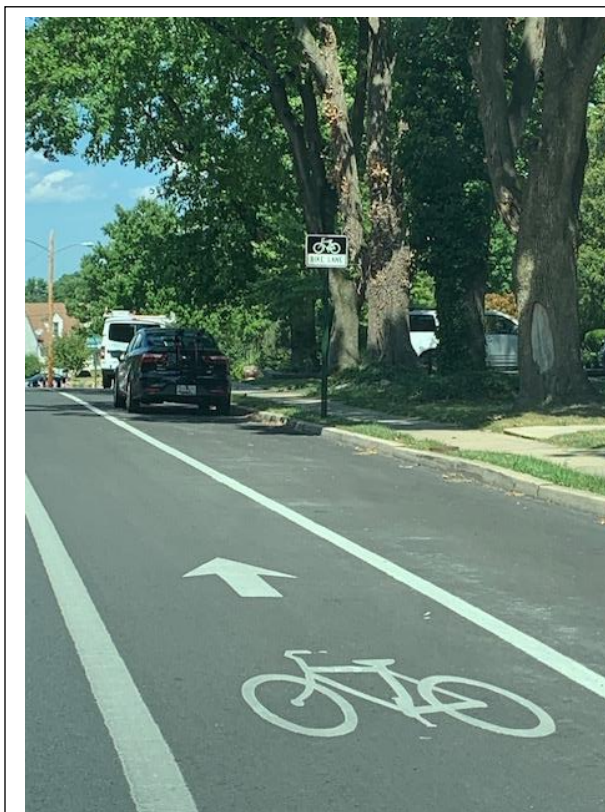
Bicycle lanes on Potomac Avenue in Hagerstown were installed with the Bicycle Master Plan Implementation project through an FY18 Bikeways award.

In addition to the project deliverables guide, a planning level cost estimating tool was developed by the Maryland Department of Transportation and the Baltimore Regional Transportation Board's Bicycle and Pedestrian Advisory Group. The tool guides applicants on project design and on estimating construction costs associated with bicycle infrastructure. The tool covers a wide range of possible expenses that are typically incurred with bicycle projects and helps applicants to more accurately predict project costs.