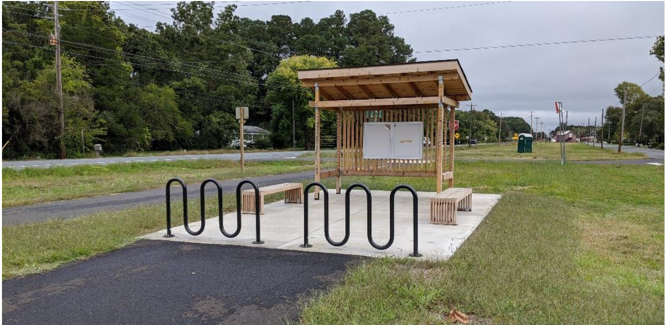
Somerset County is nearing completion of the MD 413 Hiker Biker Trail construction.