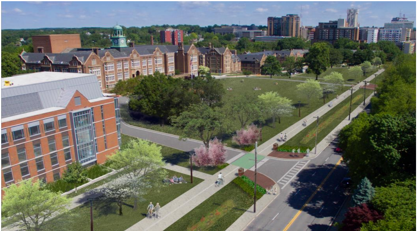
The planned Towson Neighborhood Bikeway will provide students and residents with a low-traffic-stress experience to school and area businesses. With semi-final design complete, the project will continue with final design and construction.