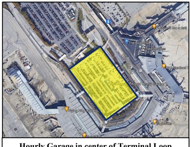
Hourly Garage in center of Terminal Loop

The GTC will be constructed in the location of the current Hourly Garage. The Hourly Garage opened in 1991 and includes $10-20 million in deferred capital expenses that is required to maintain a state of good repair but would not increase its useable life. The Hourly Garage requires long unassisted walks for users, can no longer accommodate the growing need for additional parking and changing vehicles modes and types, and cannot support the increased charging demand for EV infrastructure. Alternatives for the most effective replacement of the Hourly Garage with the new GTC will be evaluated and screened for cost and operational