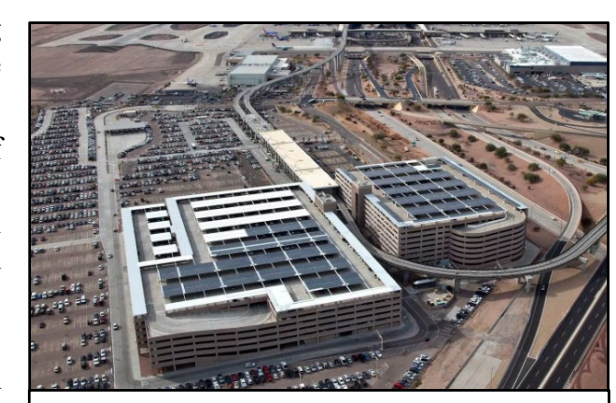
Rooftop solar parking canopies at PHX