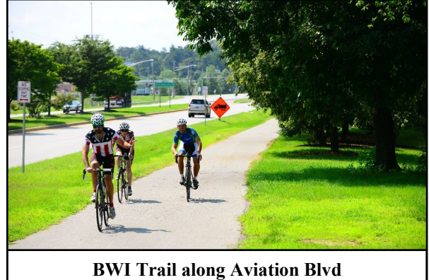
BWI Iran along Aviation bivu

The Study will develop concepts for an APM that will more efficiently connect Airport employees and users to key areas around the Airport, including remote parking lots, the BWI Marshall Amtrak station, employers, hotels and the rental car facility (See Figure 1). Implementation of an APM will reduce the reliance on personal vehicles and shuttle buses currently connecting these facilities. The BWI Business District leaders and other local leaders have voiced strong support for enhanced transportation connectivity to the Airport and potential Transit Oriented Development (TOD) opportunities.