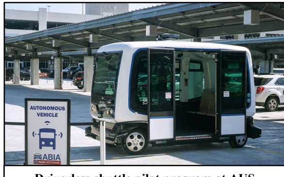
Driverless shuttle pilot program at AUS

include storage for future autonomous vehicle fleets or higher floor-to-floor heights in garages to accommodate commercial uses