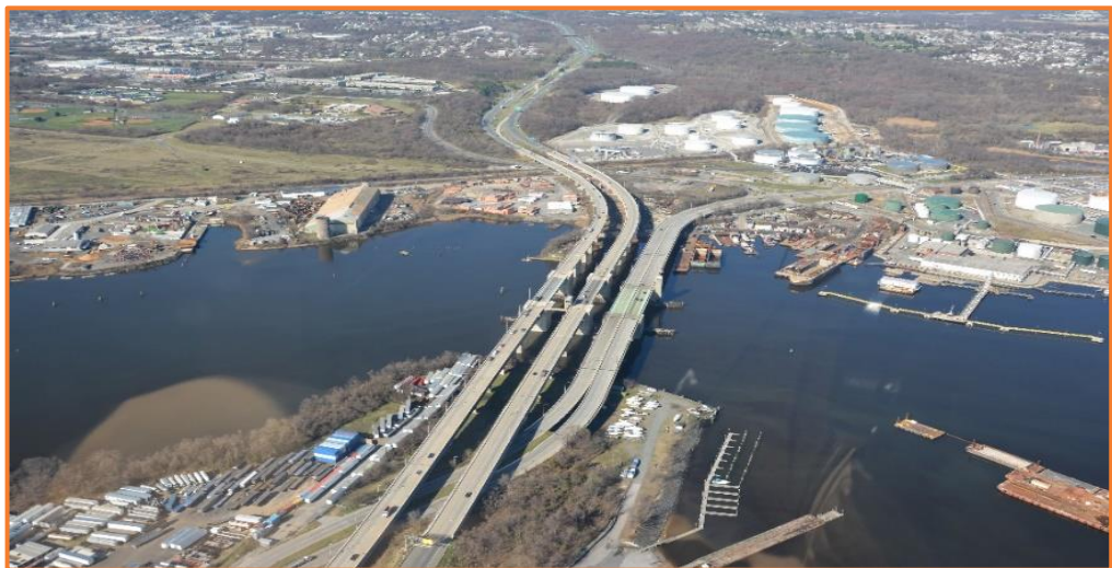
Figure 1. Aerial View of Curtis Creek Drawbridges (left) and Maryland Route 173 Drawbridge (right) Looking West

This critical bridge rehabilitation project strongly